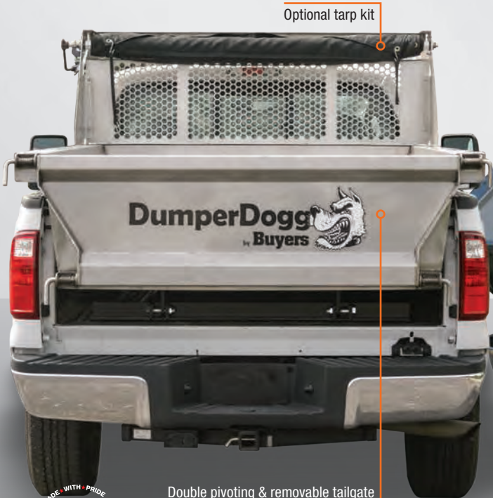
Optional tarp kit