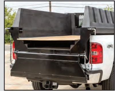
New design accommodates full sheets of plywood