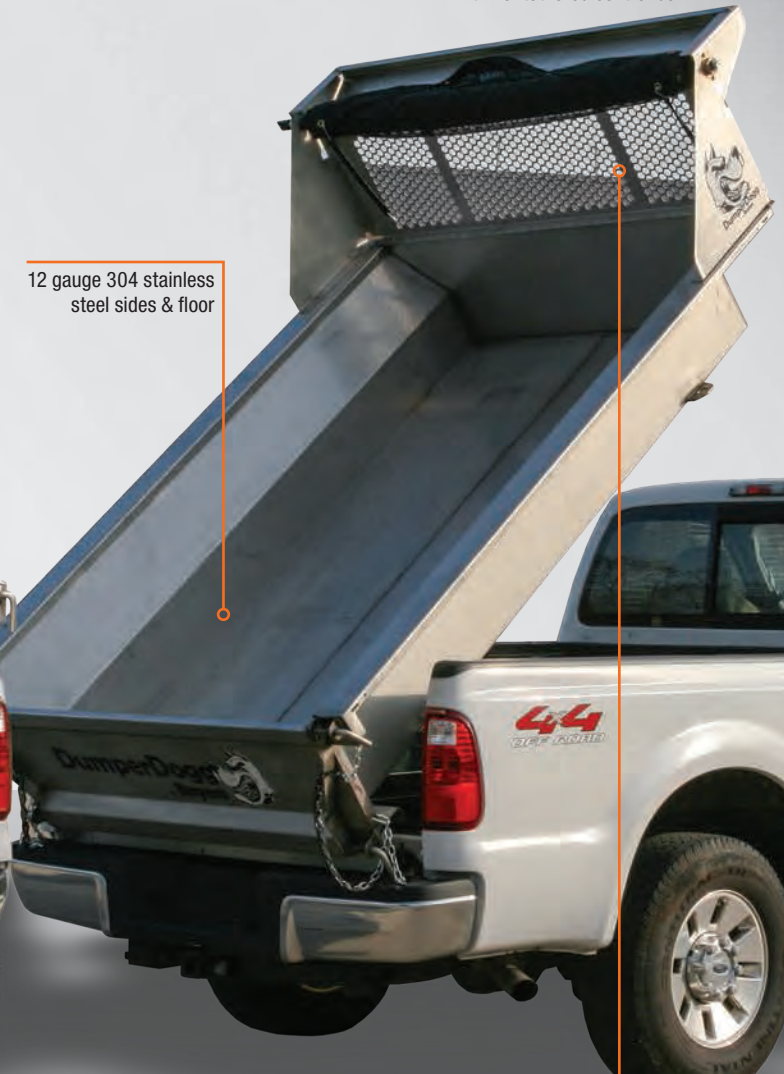
12 gauge 304 stainless steel sides & floor