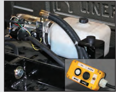
Power up & power down Monarch power unit with 10' tethered control box