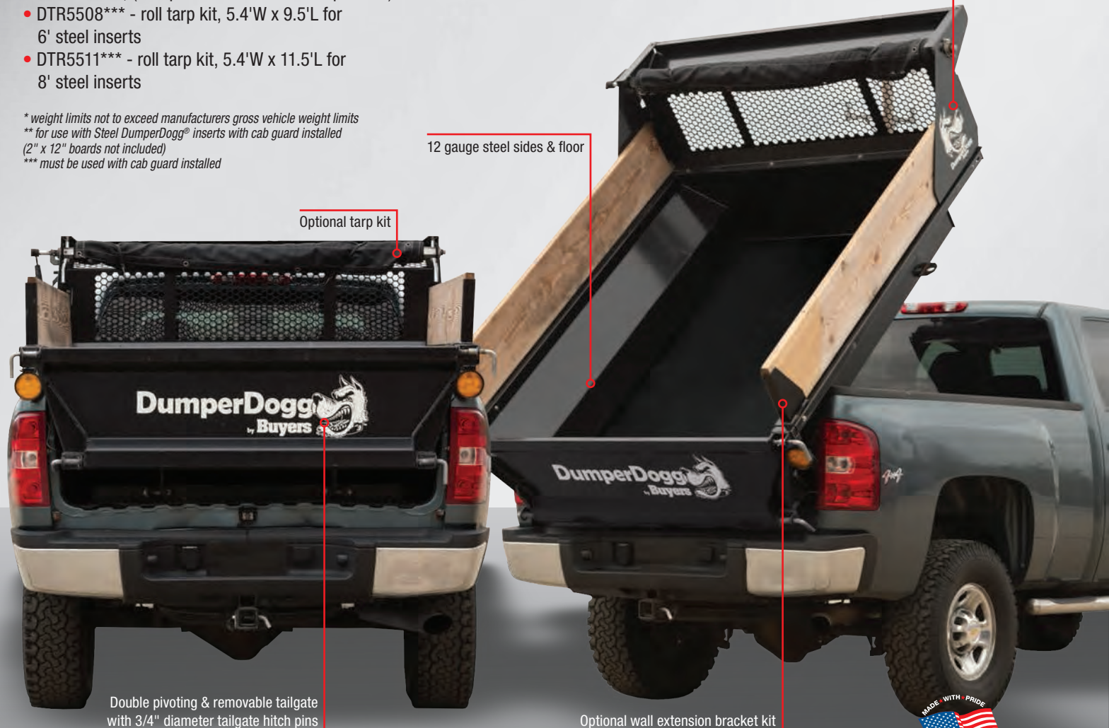
Optional tarp kit