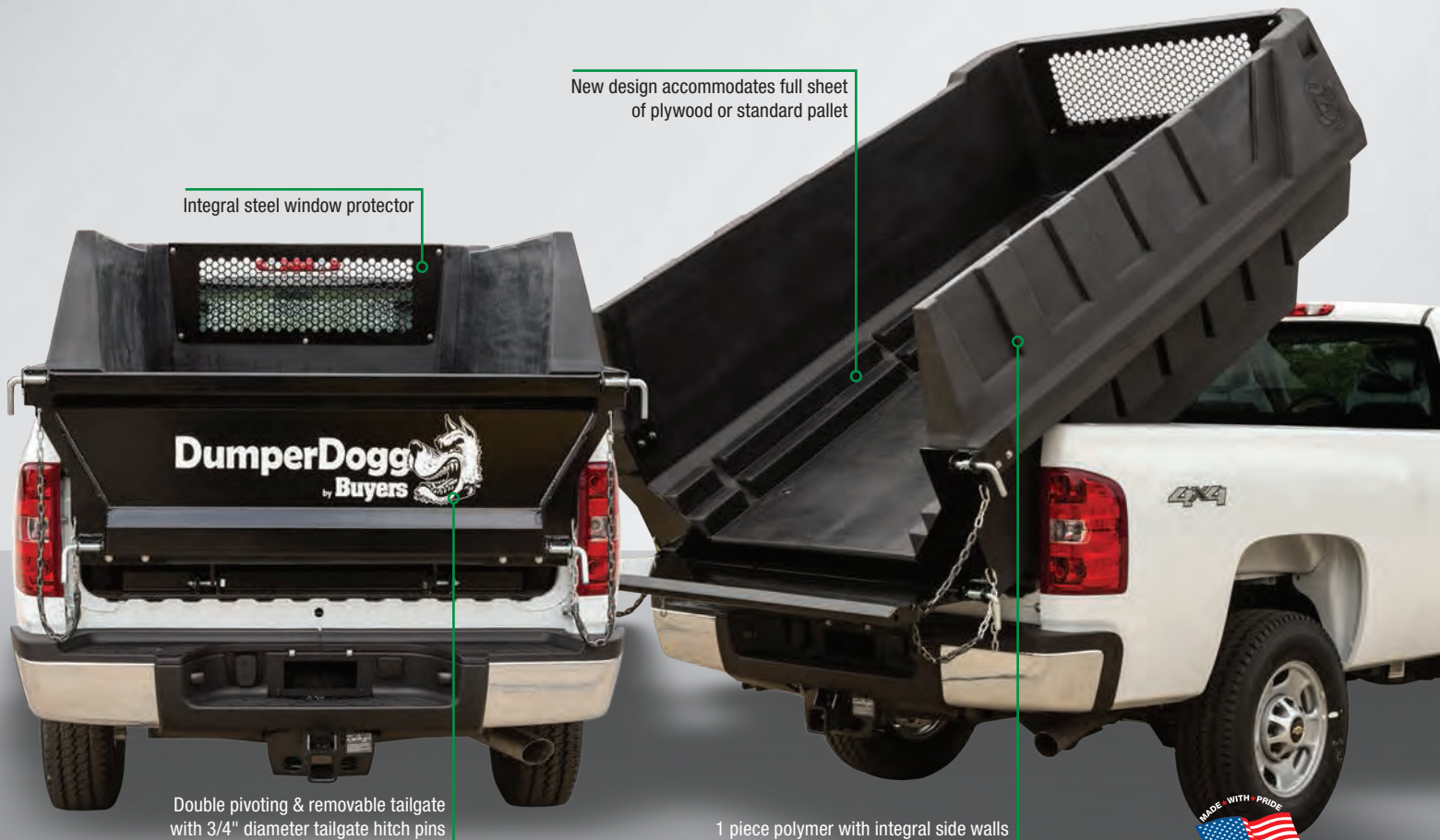
Integral steel window protector