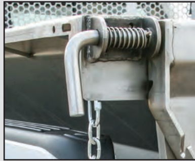
3/4" Diameter stainless steel tailgate hitch pins