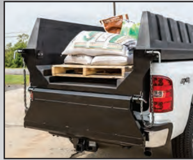
New design accommodates standard pallet

*weight limits not to exceed manufacturers gross vehicle weight limits