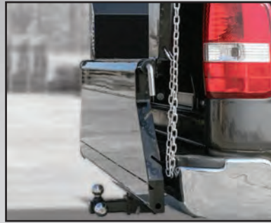
Double pivoting & removable tailgate