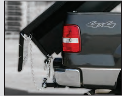
Double pivoting & removable tailgate