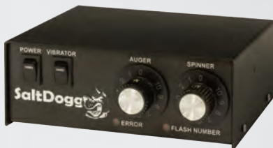
3016934 - Variable speed controller