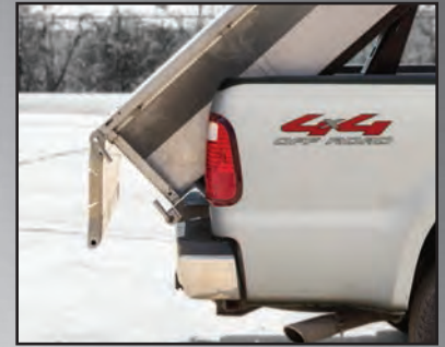
Double pivoting & removable tailgate