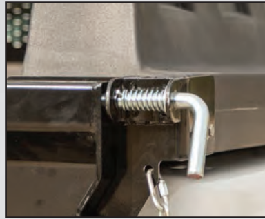
3/4" Diameter tailgate hitch pins