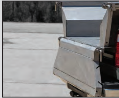
Double pivoting & removable tailgate

*** must be used with cab guard installed