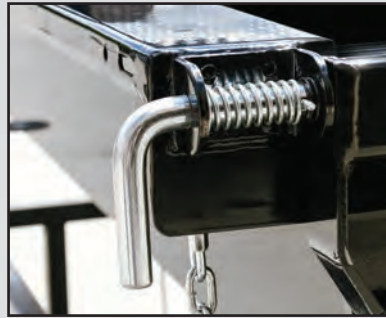
3/4" Diameter tailgate hitch pins