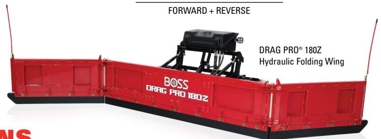
DRAG PRO® 180Z Hydraulic Folding Wing