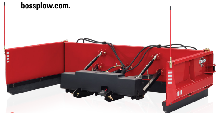
DRAG PRO® 8'-16' Retracted

Use only Genuine BOSS Parts & Accessories to enhance the performance and extend the life of your BOSS DRAG PRO®. Ask your dealer about optional accessories or shop online at bossplow.com .