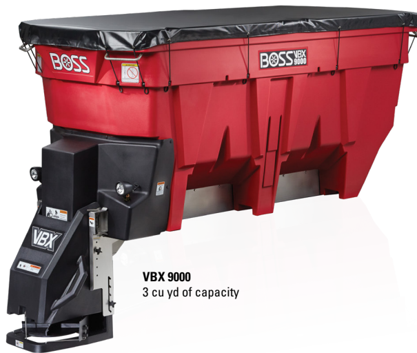
VBX 9000 3 cu yd of capacity

Optional pre-wet allows contractors to pre-wet solid deicing material, improving material performance. (Limited availability; see dealers for details.)